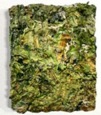
Joel Longenecker (1963-) Untitled Oil on panel Date: 2023 Size: 14" x 11"