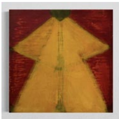
Chuck Webster (1970-) A Small Shot For A.L. Acrylic and ink on panel Date: 1997 Size: 9" x 9"