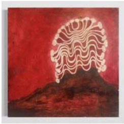
Chuck Webster (1970-) Wise Men Oil on wood panel Date: 2017 Size: 12" x 12"