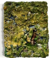
Joel Longenecker (1963-) Untitled Oil on panel Date: 2023 Size: 14" x 11"