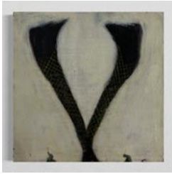
Chuck Webster (1970-) Secret Acrylic and ink on panel Date: 1997 Size: 9" x 9"