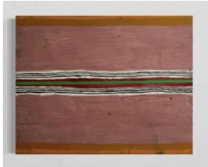
Chuck Webster (1970-) Untitled Acrylic and ink on panel Date: 1997 Size: 7 3/4" x 9 5/8"