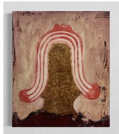
Chuck Webster (1970-) Untitled (The Little Red-Haired Girl) Oil on panel Date: 2010 Size: 11 3/4" x 9 7/8"