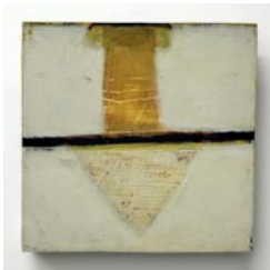
Chuck Webster (1970-) Hot Ticket Acrylic and ink on panel Date: 1997 Size: 9 1/2" x 9 1/2"