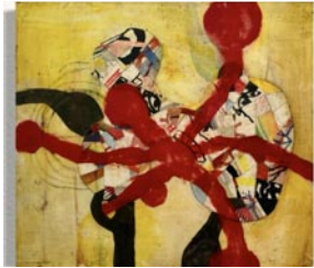
Chuck Webster (1970-) Untitled Oil, ink, collage on panel Date: 2002 Size: 10 3/4" x 12"