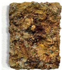
Joel Longenecker (1963-) Untitled Oil on panel Date: 2023 Size: 12" x 9"