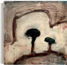
Chuck Webster (1970-) Untitled Oil and spray paint on panel Date: 2013 Size: 12" x 12"