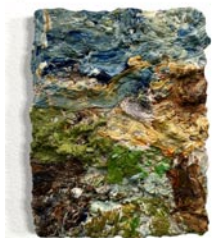
Joel Longenecker (1963-) Untitled Oil on panel Date: 2023 Size: 12" x 9"