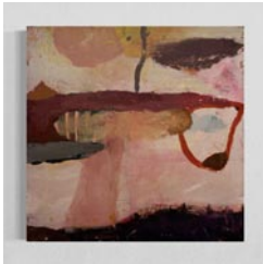
Chuck Webster (1970-) Fable Oil on panel Date: 2000 Size: 9" x 9"