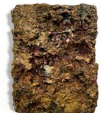
Joel Longenecker (1963-) Untitled Oil on panel Date: 2023 Size: 12" x 9"