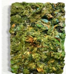
Joel Longenecker (1963-) Untitled Oil on panel Date: 2023 Size: 12" x 9"