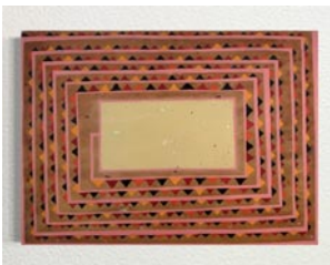
Chuck Webster (1970-) Dutch Ripple Oil on panel Date: 2003 Size: 10 3/4" x 13 15"