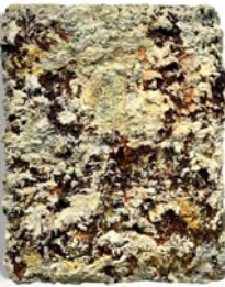
Joel Longenecker (1963-) Untitled Oil on panel Date: 2018 Size: 18" x 14"