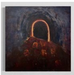
Chuck Webster (1970-) They All Go Into The Dark Oil on panel Date: 2011 Size: 12" x 12"